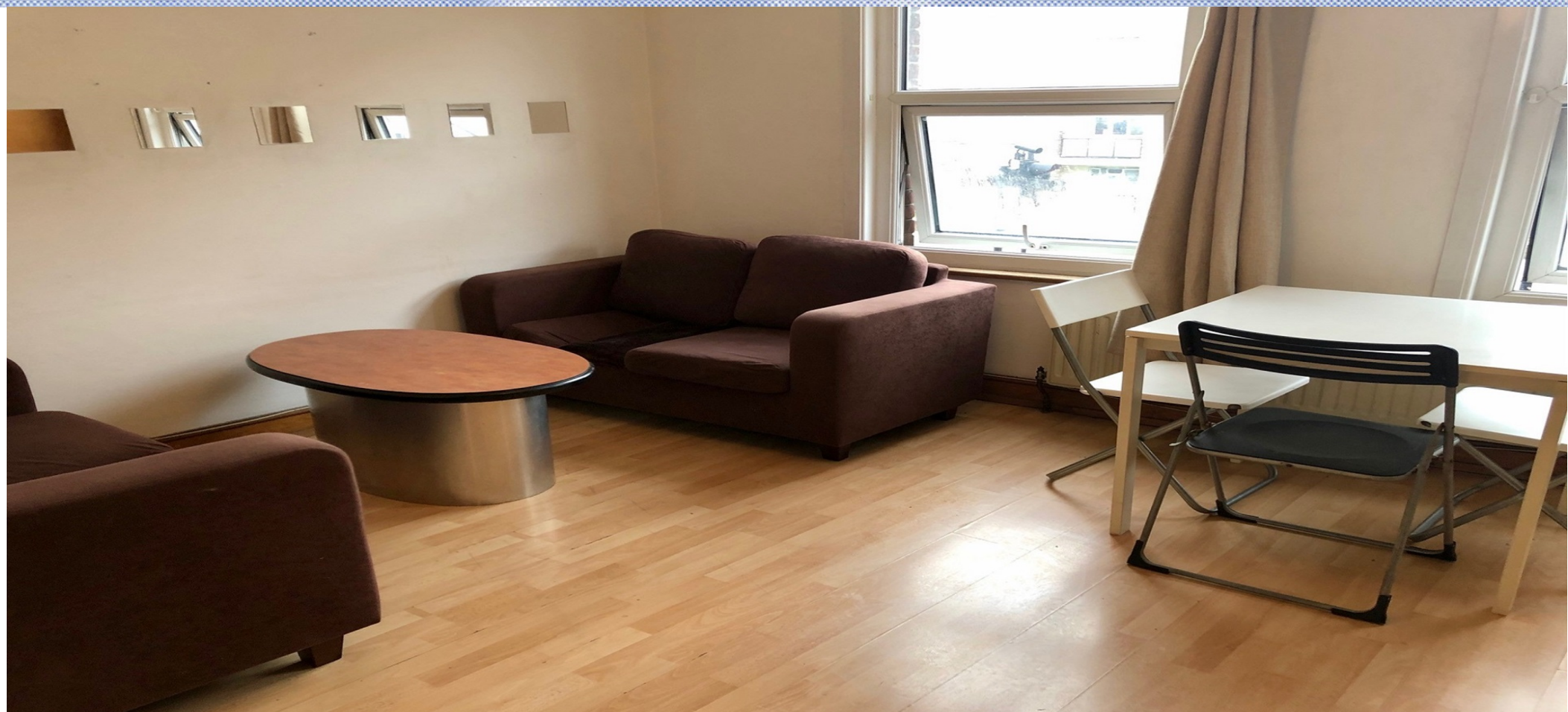
2 Bedroom Apartment To Rent In Camberwell £340 p.w. (£1473 pcm)