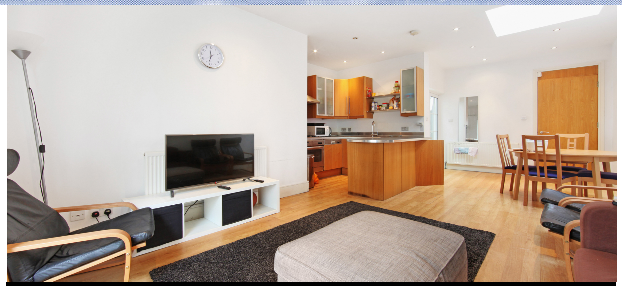
2 Bedroom Apartment To Rent In London Bridge £485 p.w. (£2100 pcm)