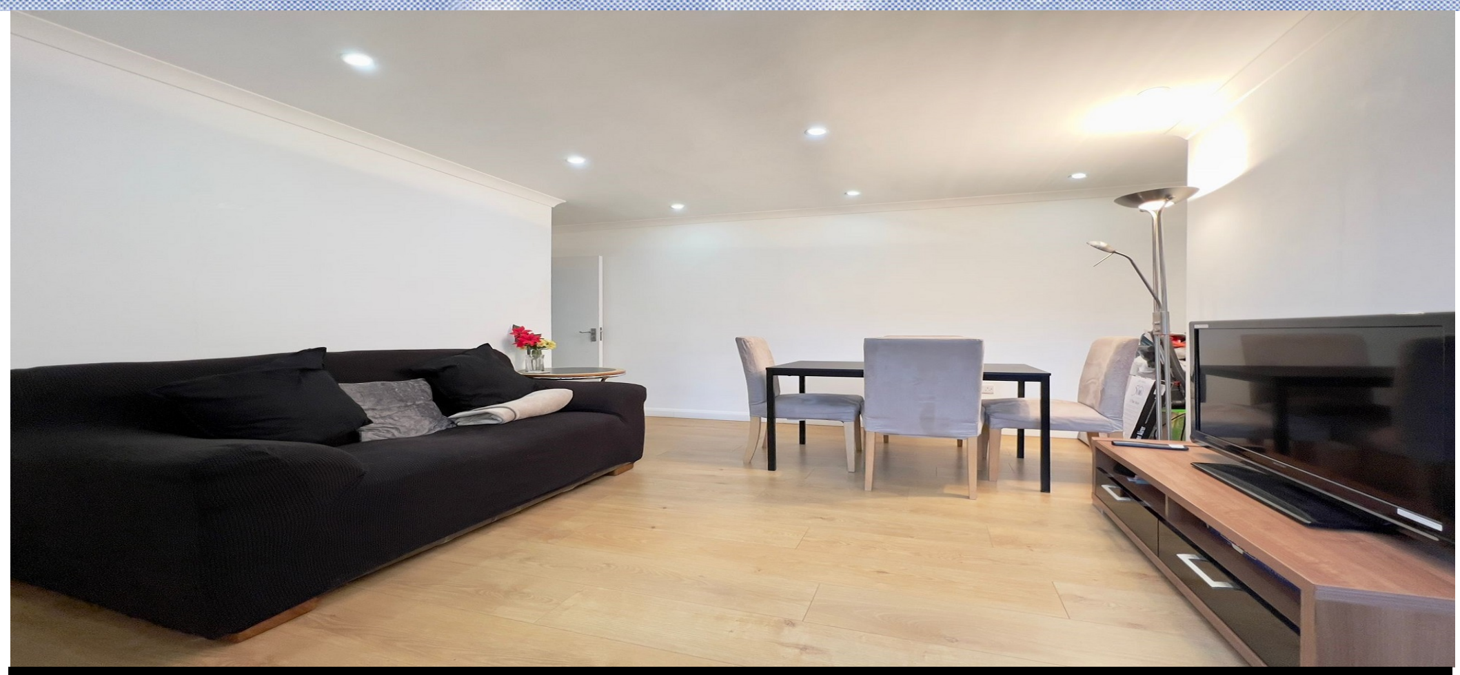
3 Bedroom Apartment To Rent In Elephant And Castle £585 p.w. (£2535 pcm)