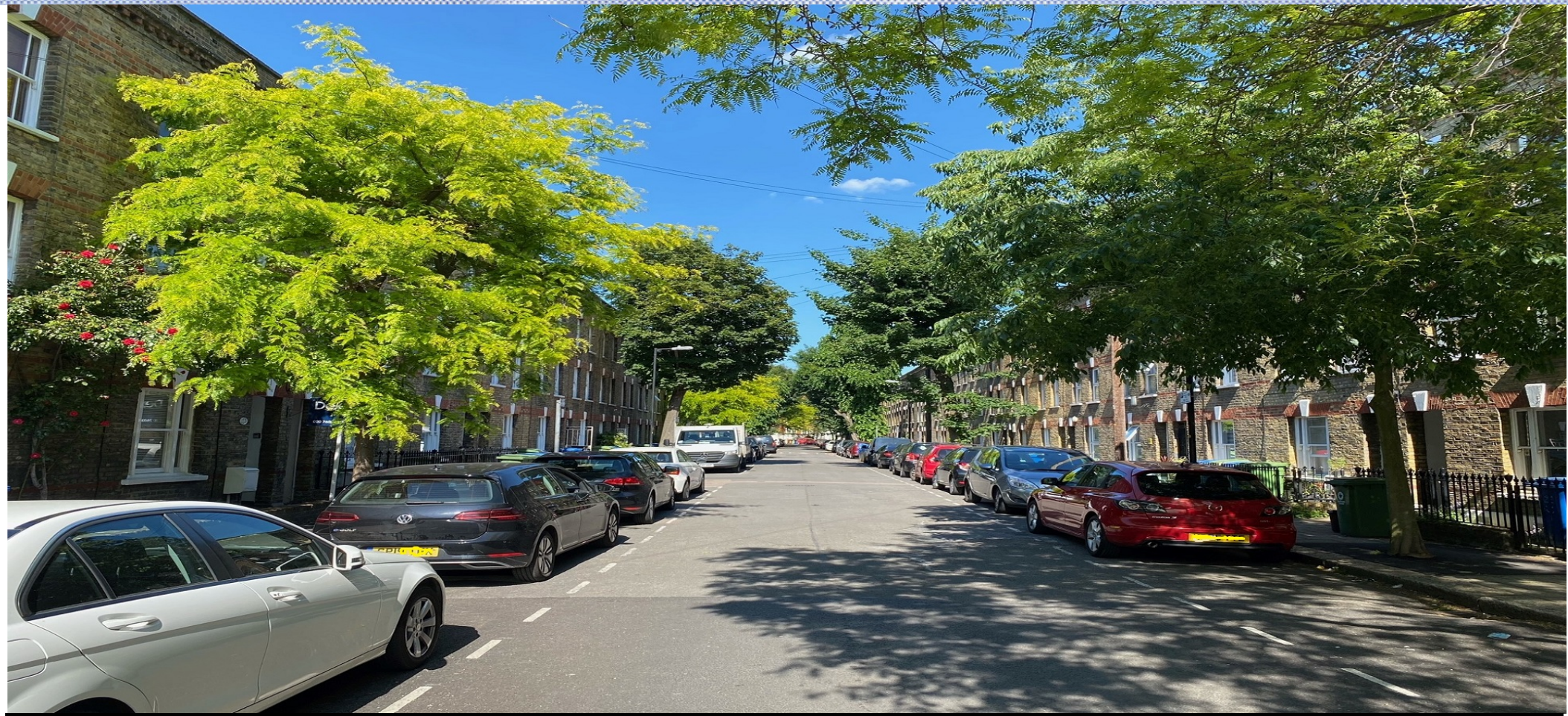
4 Bedroom Terraced House To Rent In Elephant And... £950 p.w. (£4117 pcm)