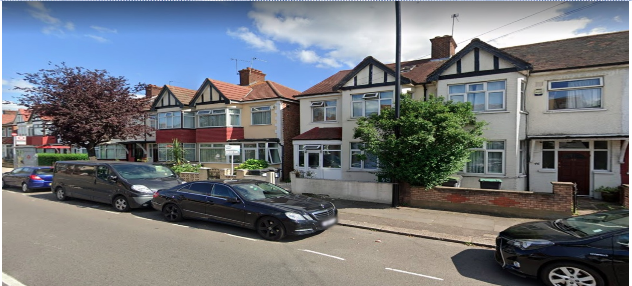
5 Bedroom House Rent In Wood Green £ 850 (£3683 pcm)