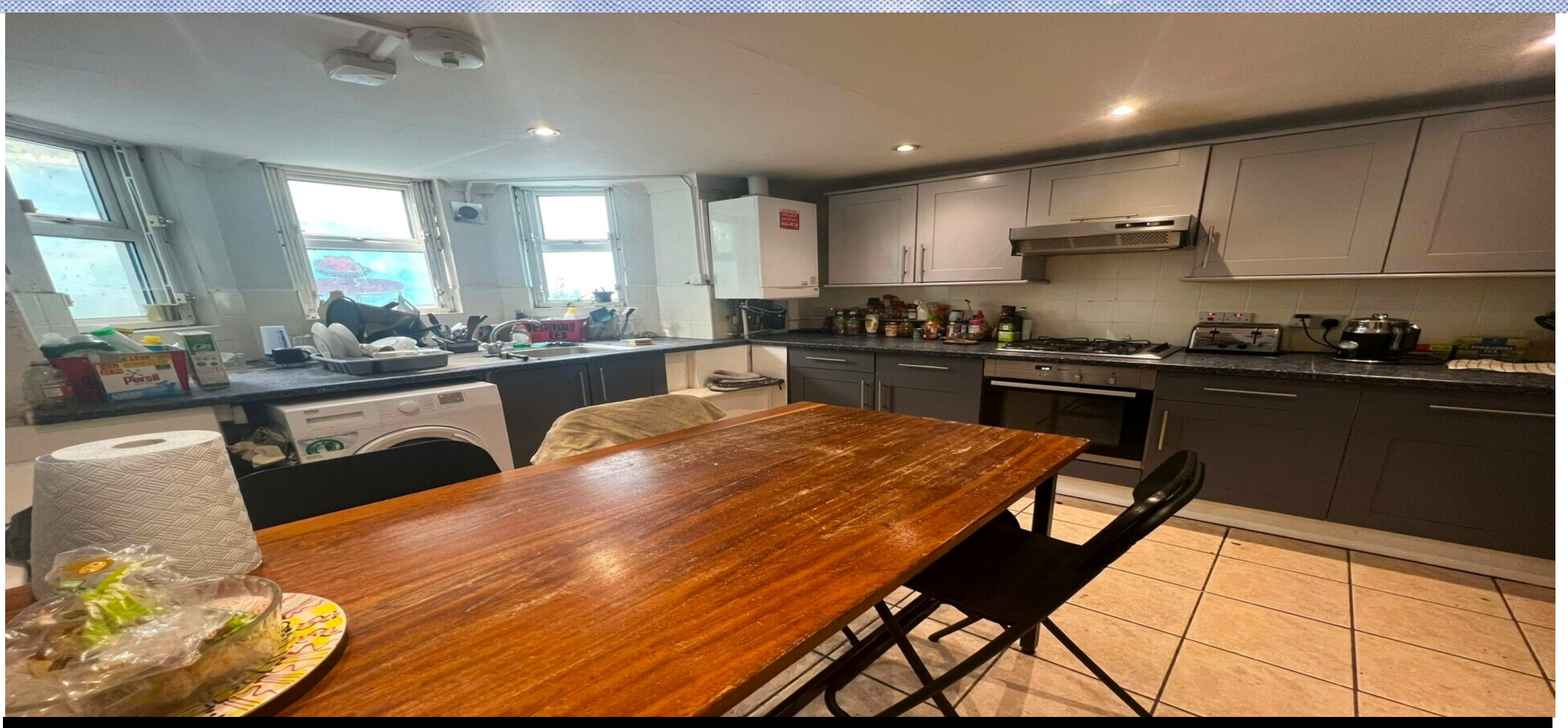
6 Bedroom House Rent In Tufnell Park£ 1326pw (£5750 pcm)