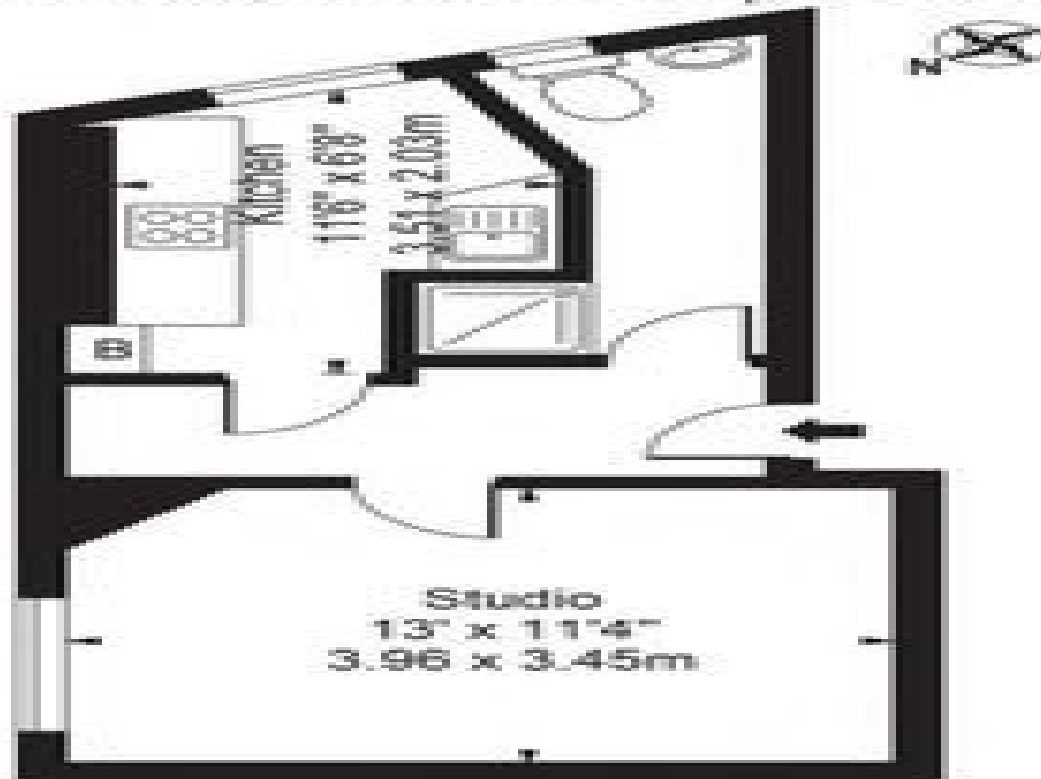
First Floor For Illustration Purposes Only - Not To Scale

Abingdon Road Approx. Gross Internal Area 331 Sq Ft - 30.75 Sq M